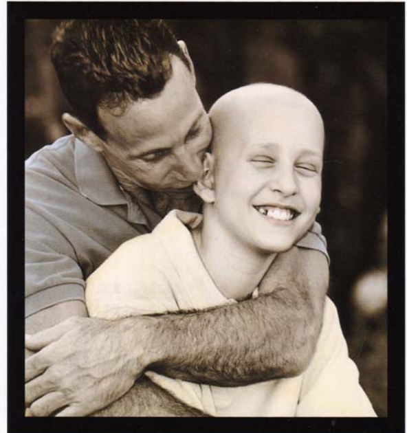
Holding blessings with our eyes.